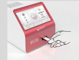
Biozek Cassette Insert