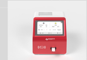
Result Display and Print