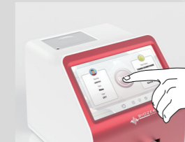
Select Standard Mode, Tap RUN for Countdown