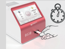
Biozek Cassette Insert