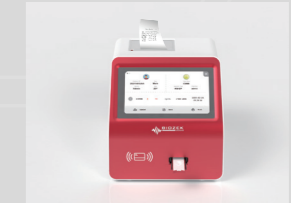
Result Display and Print