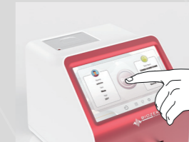
Select Quick Mode, Tap RUN